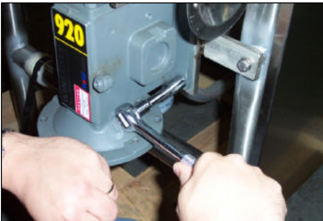
Removing the nuts holding the gear reducer on.

23. Remove the gear drive by using the 9/16" socket and ratchet, as well as the combination wrench as required, to remove the nuts holding it to the mounting plate.